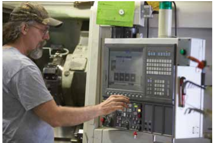
An employee on the line at Darco Manufacturing, Inc., in Syracuse, host of the Manufacturing Careers Partnership press announcement.